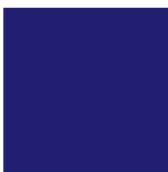
PMS 274 C

The Southwest Veterinary Symposium logo consists of a complex graphic element and two type treatments. Under no circumstances should these elements be divided or used separately.