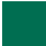
100% Cyan 0% Magenta 71% Yellow 43% Black

If spot colors cannot be used, use the four-color process (CMYK) combinations shown to the left.