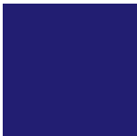
100% Cyan 100% Magenta 0% Yellow 28% Black

The font used to create the text is Lapidary Regular. The graphic element is a modification of the universal veterinary symbol and a compass. When using spot colors, the SWVS logo consists of PMS 274 C and PMS 342 C. Please see the color blocks to the left.